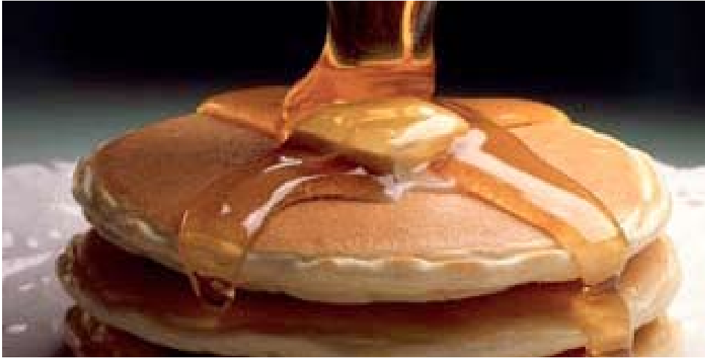
The warm pancakes at the Senior Renaissance Center are hard to beat on a chilly fall morning.

The Senior Renaissance Center will hold its annual Community Fallfest on Saturday, Oct. 16, from 7 a.m. to noon in the basement of the Cohn Adult Learning Center (4805 Park Avenue). A pancake breakfast will be served, and the event will also include a country store/flea